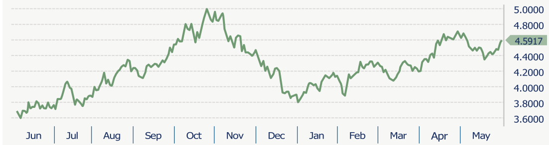
10 Year U.S. Treasury Yield 5/30/2023–5/29/2024